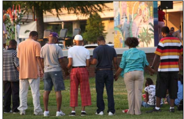
Attendees honoring those lost to HIV/AIDS at HAART's 2008 "Light Up the Levee".